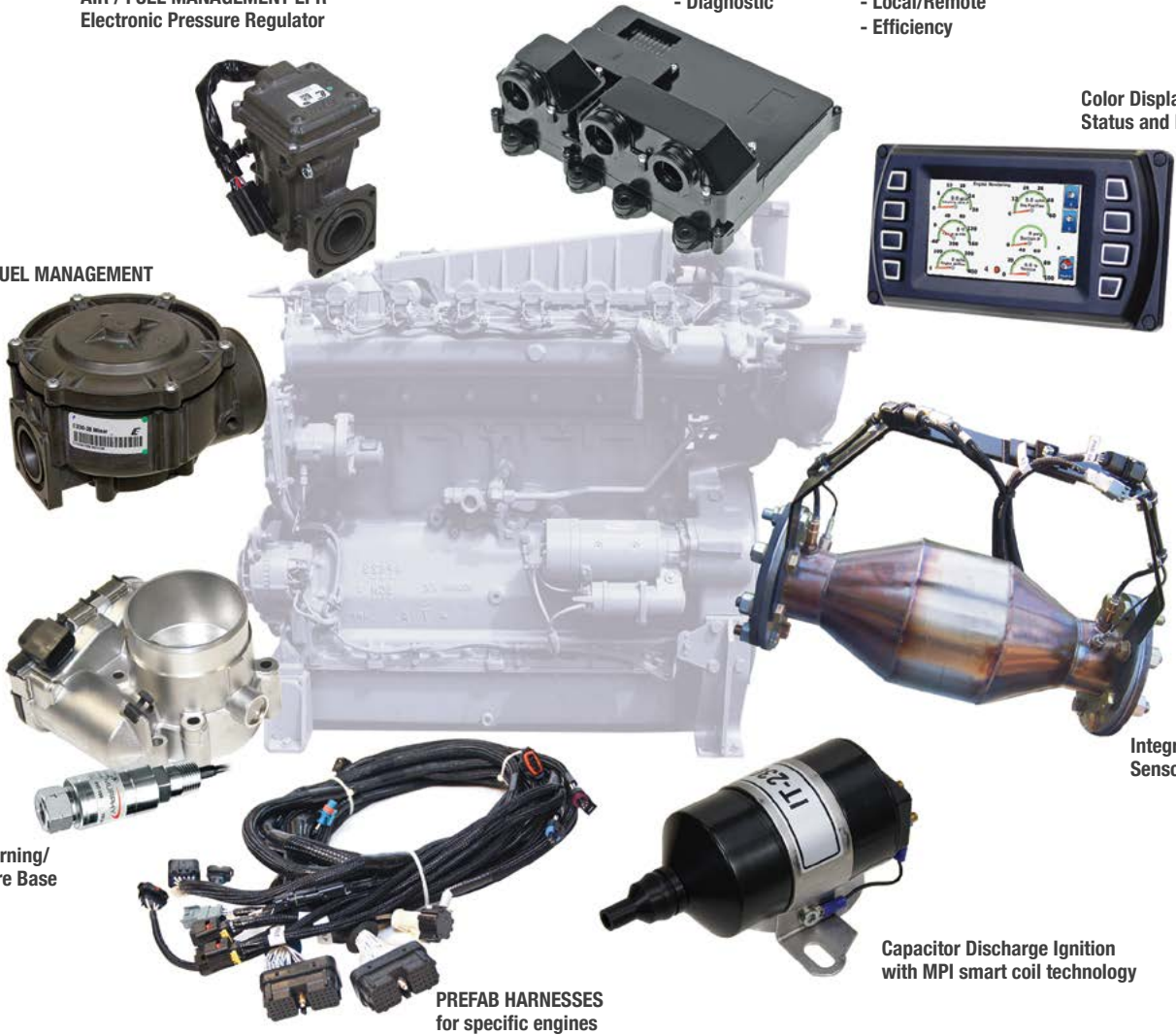
Electronic Governing/ Suction Pressure Base Speed Control