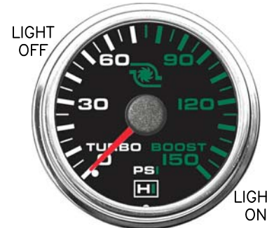
P/N 102-105-4R-2 SCALE: 3/4