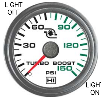
P/N 102-105-2R-1 SCALE: 3/4

DIAL FACE COLORS POINTER COLOR BEZEL COLOR & STYLE