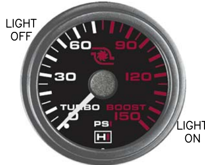
P/N 102-105-3W-1 SCALE: 3/4