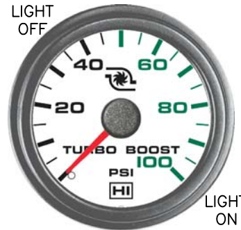
P/N 102-104-2R-1 SCALE: 3/4

DIAL FACE COLORS POINTER COLOR BEZEL COLOR & STYLE