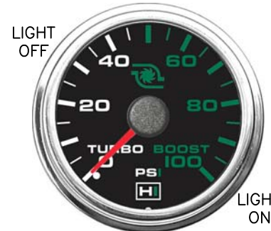
P/N 102-104-4R-2 SCALE: 3/4