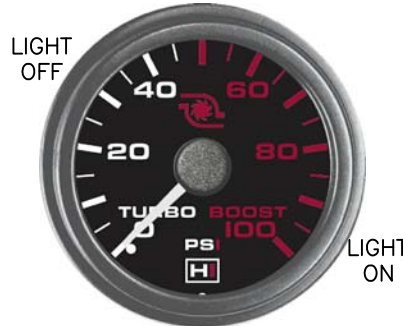
P/N 102-104-3W-1 SCALE: 3/4