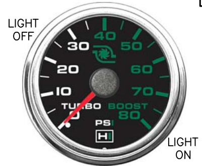
P/N 102-103-4R-2 SCALE: 3/4