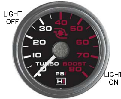
P/N 102-103-3W-1 SCALE: 3/4