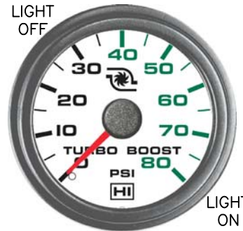
P/N 102-103-2R-1 SCALE: 3/4

DIAL FACE COLORS POINTER COLOR BEZEL COLOR & STYLE