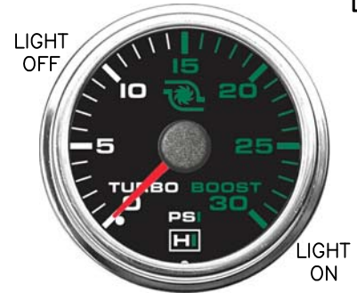
P/N 102-101-4R-2 SCALE: 3/4