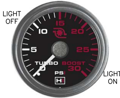
P/N 102-101-3W-1 SCALE: 3/4