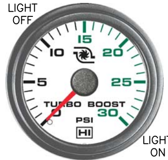
P/N 102-101-2R-1 SCALE: 3/4

DIAL FACE COLORS POINTER COLOR BEZEL COLOR & STYLE