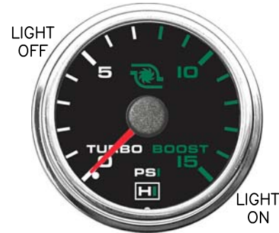
P/N 102-100-4R-2 SCALE: 3/4