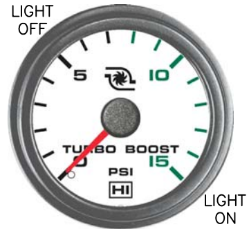
P/N 102-100-2R-1 SCALE: 3/4

DIAL FACE COLORS POINTER COLOR BEZEL COLOR & STYLE