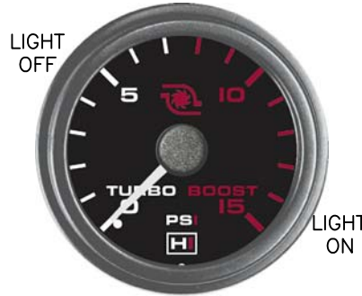
P/N 102-100-3W-1 SCALE: 3/4