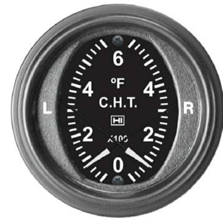
P/N 010-321-1W-1 SCALE: 1/1

This document involves CONFIDENTIAL proprietary design rights of HEWITT IND. and all designs, manufacturing, reproduction, use and sale rights regarding same are expressly reserved. It is submitted under a confidential relationship and the recipient agrees to assume custody and control thereof and that proprietary information contained herein shall not be reproduced or transferred to others or used for manufacturing or any other purpose without prior written permission of HEWITT IND.