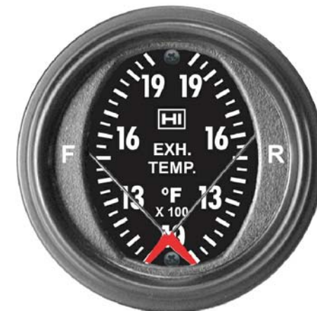
P/N 010-308-1R-4 (FRONT & REAR) SCALE: 1/1

This document involves CONFIDENTIAL proprietary design rights of HEWITT IND. and all designs, manufacturing, reproduction, use and sale rights regarding same are expressly reserved. It is submitted under a confidential relationship and the recipient agrees to assume custody and control thereof and that proprietary information contained herein shall not be reproduced or transferred to others or used for manufacturing or any other purpose without prior written permission of HEWITT IND.