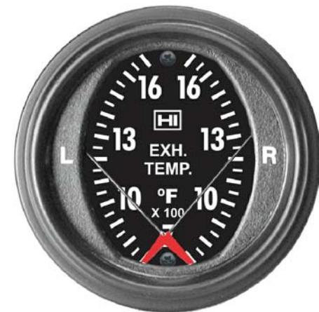
P/N 010-307-1R-4 SCALE: 1/1

010-307-XX-X DIAL COLOR POINTER COLOR BEZEL STYLE & COLOR