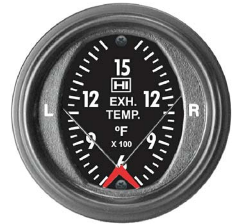
P/N 010-306-1R-4 SCALE: 1/1

010-306-XX-X DIAL COLOR POINTER COLOR BEZEL STYLE & COLOR