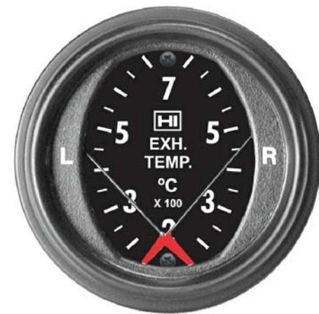
P/N 010-304-1R-4 SCALE: 1/1

010-304-XX-X DIAL COLOR POINTER COLOR BEZEL STYLE & COLOR