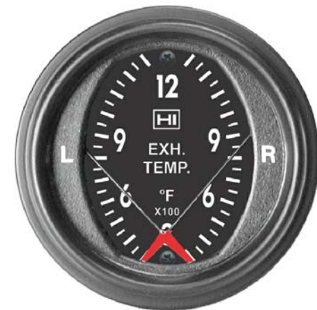
P/N 010-301-1R-4 SCALE: 1/1

010-301-XX-X DIAL COLOR POINTER COLOR BEZEL STYLE & COLOR