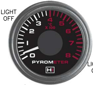
P/N 010-212-3W-1 SCALE: 3/4