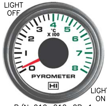
P/N 010-212-2R-1 SCALE: 3/4

DIAL FACE COLORS POINTER COLOR BEZEL COLOR & STYLE