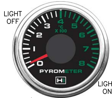
P/N 010-212-4R-2 SCALE: 3/4