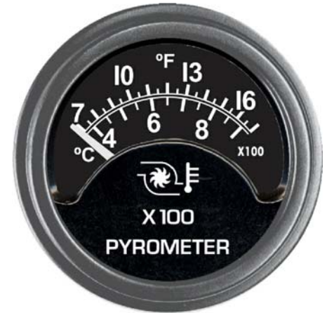
P/N 010-114-1W-1 SCALE: 1/1

010-114-XX-X DIAL COLOR POINTER COLOR BEZEL STYLE & COLOR