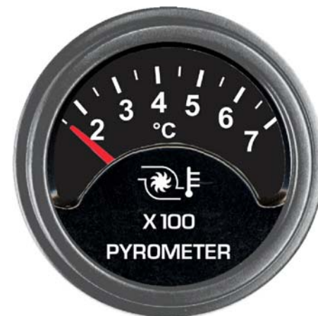
P/N 010-013-1R-1 SCALE: 1/1

This document involves CONFIDENTIAL proprietary design rights of HEWITT IND. and all designs, manufacturing, reproduction, use and sale rights regarding same are expressly reserved. It is submitted under a confidential relationship and the recipient agrees to assume custody and control thereof and that proprietary information contained herein shall not be reproduced or transferred to others or used for manufacturing or any other purpose without prior written permission of HEWITT IND.