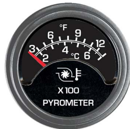
P/N 010-112-1R-1 SCALE: 1/1

This document involves CONFIDENTIAL proprietary design rights of HEWITT IND. and all designs, manufacturing, reproduction, use and sale rights regarding same are expressly reserved. It is submitted under a confidential relationship and the recipient agrees to assume custody and control thereof and that proprietary information contained herein shall not be reproduced or transferred to others or used for manufacturing or any other purpose without prior written permission of HEWITT IND.