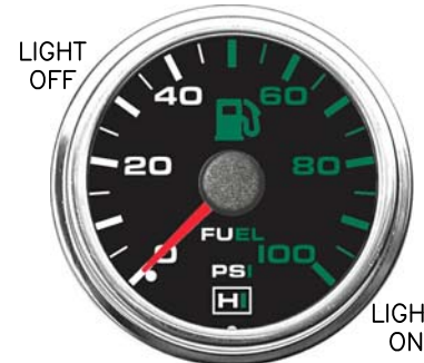
P/N 100-104-3W-1 SCALE: 3/4