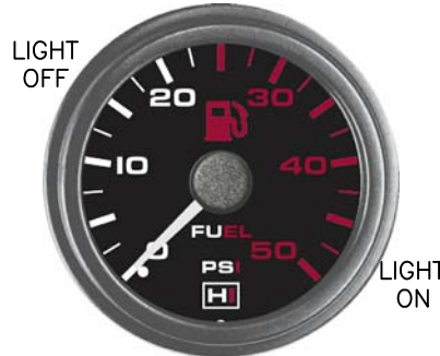
P/N 100-102-3W-1 SCALE: 3/4