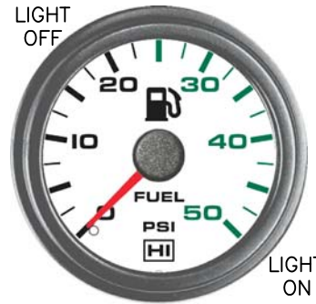
P/N 100-102-2R-1 SCALE: 3/4

DIAL FACE COLORS POINTER COLOR BEZEL COLOR & STYLE