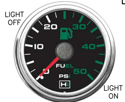
P/N 100-102-4R-2 SCALE: 3/4