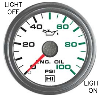
P/N 101-104-2R-1 SCALE: 3/4

DIAL FACE COLORS POINTER COLOR BEZEL COLOR & STYLE