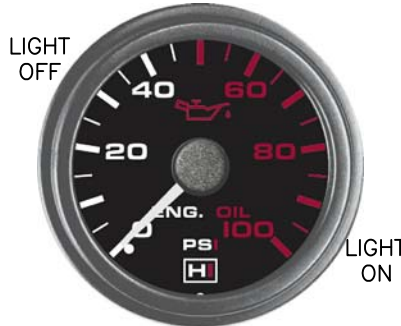
P/N 101-104-3W-1 SCALE: 3/4