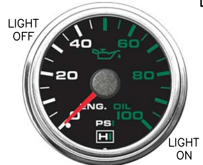
P/N 101-104-4R-2 SCALE: 3/4