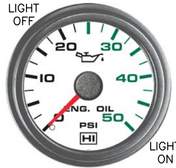
P/N 101-102-2R-1 SCALE: 3/4

DIAL FACE COLORS POINTER COLOR BEZEL COLOR & STYLE