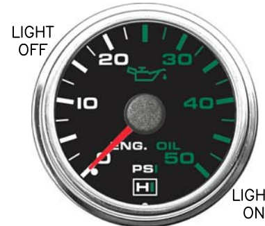
P/N 101-102-4R-2 SCALE: 3/4