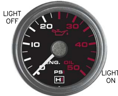
P/N 101-102-3W-1 SCALE: 3/4