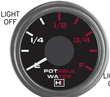
P/N 120-22W-3W-1 SCALE: 3/4