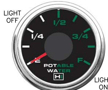
P/N 120-22W-4R-2 SCALE: 3/4