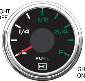
P/N 120-22F-4R-2 SCALE: 3/4