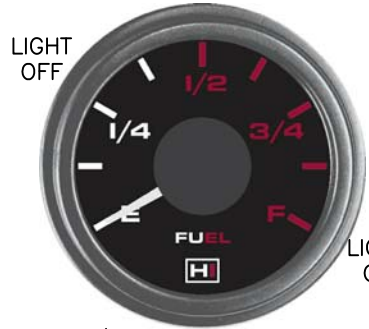
P/N 120-22F-3W-1 SCALE: 3/4