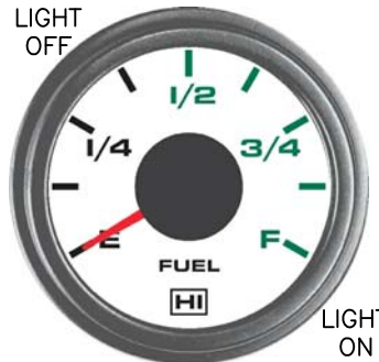
P/N 120-22F-2R-1 SCALE: 3/4

DIAL FACE COLORS POINTER COLOR BEZEL COLOR & STYLE